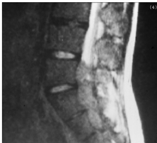
Figure 2: A) Mid-sagittal T2-weighted MR image of the sacral spine showing a presacral mass and an intraspinal epidural mass. B) Axial MR image of the lower thorax showing spinal canal stenosis due to epidural mass