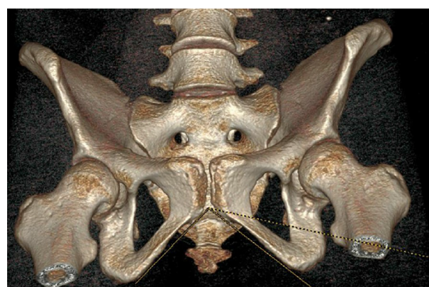
Figure 1. Measurement of the subpubic angle at three dimensional (3D) volume-rendered multidetector computed tomography (MDCT)

visualized on the volume-rendered images. The angle between the ventral faces of bilateral inferior pubic ramus (the subpubic angle) were measured using an automatic angle meter (Figure 1). FO was best displayed on the right and left oblique images, and the aspect ratio was determined by the ratio of the largest transverse diameter to the largest longitudinal diameter (Figure 2). All measurements were performed by the first author, who is experienced in the hardware and software of analysis. For each parameter evaluated, two measurements were obtained on two different days in order to avoid possible technical errors. For statistical analysis, only mean values were used.