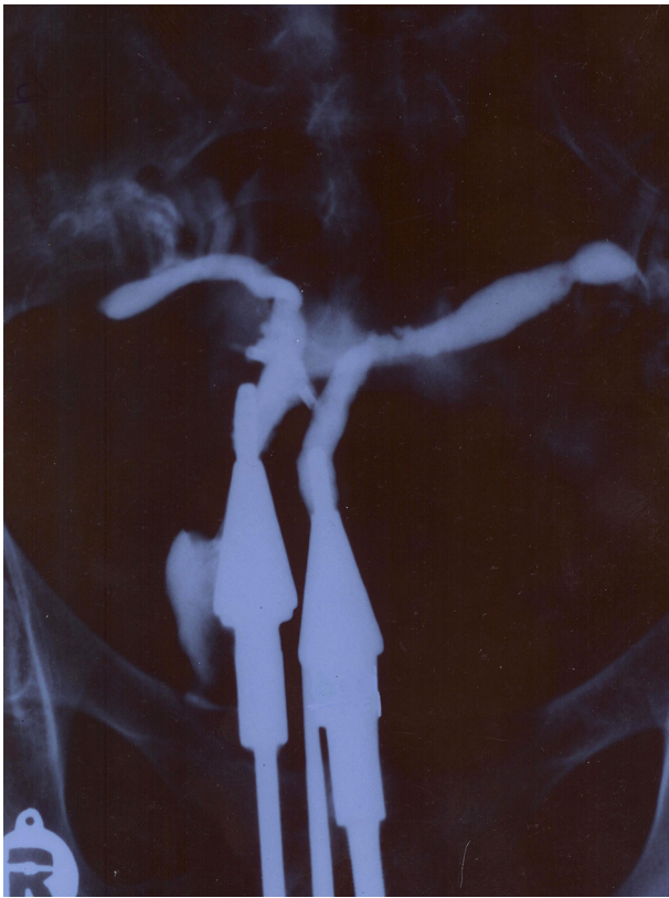
Figure 2. Third image of HSG in the same patient after cannula placement in both cervical canals simultaneously demonstrated a didelphic uterus. Two separate endocervical canals open into separate endometrial cavities.

Gynecologic examination enabled the detection of the second external os. A second image was obtained by dye installation through the second os. On the right a unicornuate uterus with a single fallopian tube and a mislocated IUD fixed at a site lower than normal was detected.