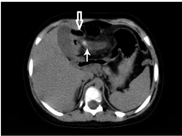
Figure 1. A 6-year-old boy with one week history of abdominal pain and tenderness, leukocytosis, and free fluids around intestines in sonography. Axial CT image demonstrates the caecum (white arrow) located in the epigastric area adjacent to the left lobe of the liver and gallbladder. The wall of the appendix is thickened, and an appendicolith (black arrow) is present in the proximal part of the appendix.