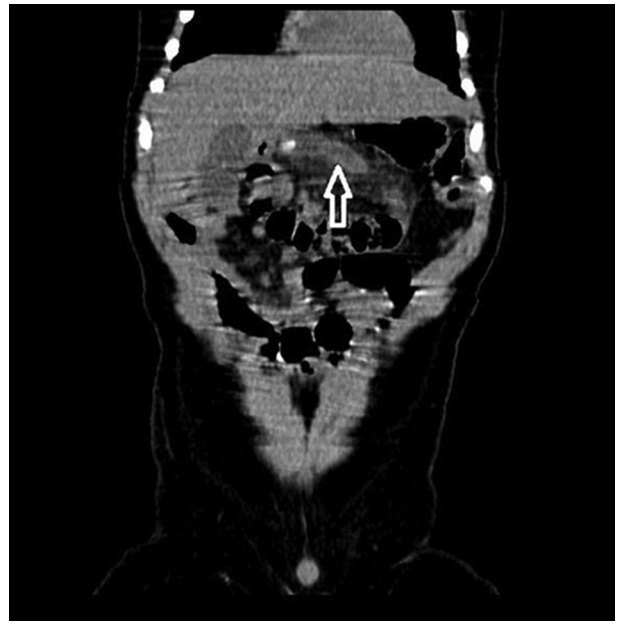
Figure 4. Coronal multi-planar reconstruction (MPR) CT slide demonstrates a tubular structure of 16 mm in diameter (white arrow), posterior to the left lobe of the liver, surrounded by inflamed mesenteric fat.