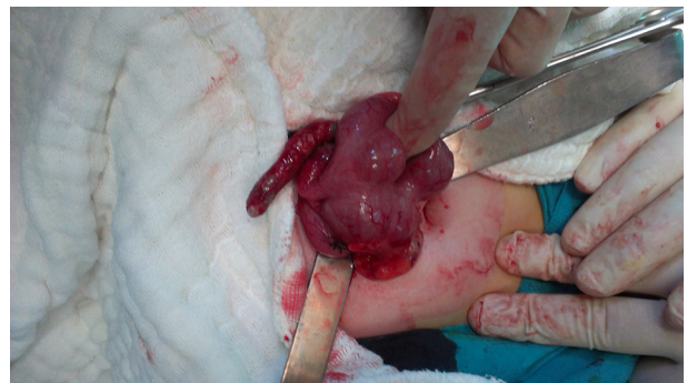
Figure 5. During the operation, the caecum was found to be mobile and located in the epigastric region. At the bottom of the caecum, a gangrenous appendix was demonstrated.

Multiple lymph nodes were identified around the appendix. An upper right paramedian incision was performed under the general anesthesia. The surgeons found that the caecum was mobile and situated in the epigastric region (Figure 5). The surgeons performed the appendectomy, and the appendiceal specimen was sent for pathological examination, the patient was discharged 4 days later.