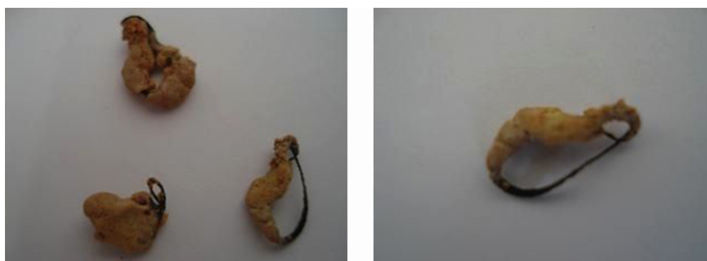
Figure 2. Urinary calculi formed around surgical sutures remnant within bladder wall