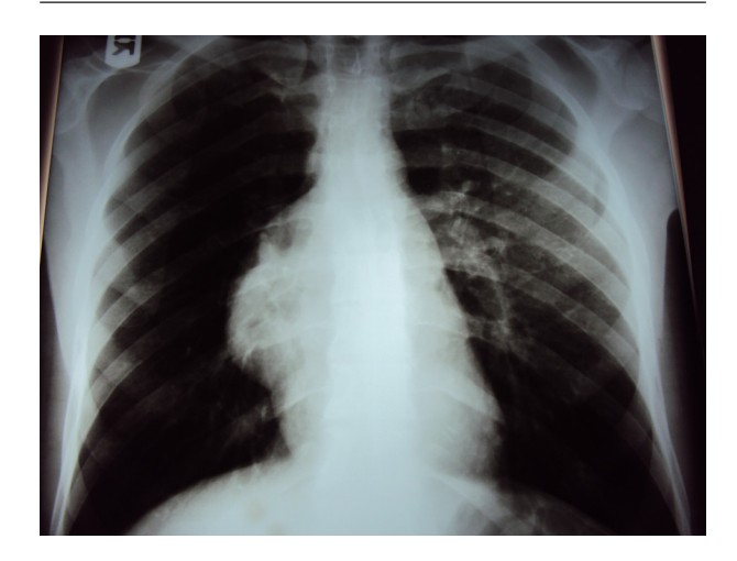
Figure 1. A 24-year-old man with dyspnea and persistent cough. Posteroanterior (PA) chest radiography revealed a well-marginated homogeneous opacity in the middle right border of the heart margin.

After 5 days, the patient was discharged uneventfully. Pathologic report confirmed the diagnosis. The patient remains symptom-free in the 12 month follow-up visit.