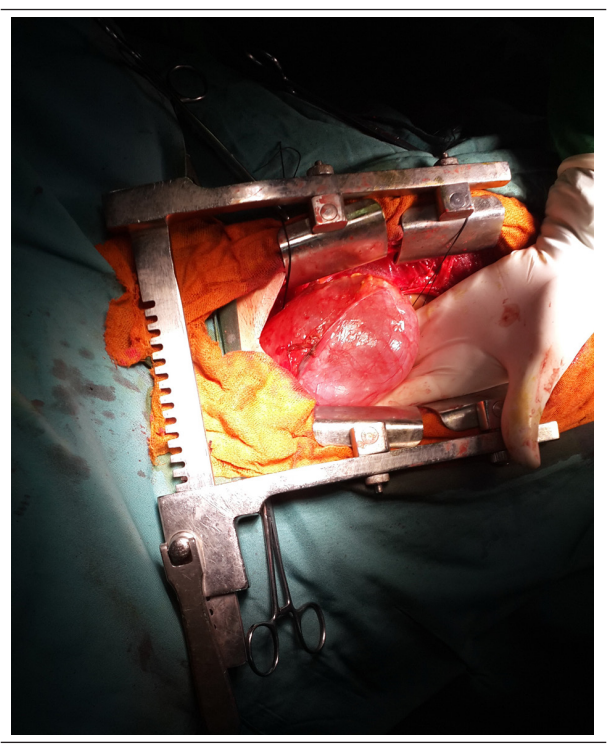
Figure 3. A thin-walled pericardial mass is seen in intra-operative photography.