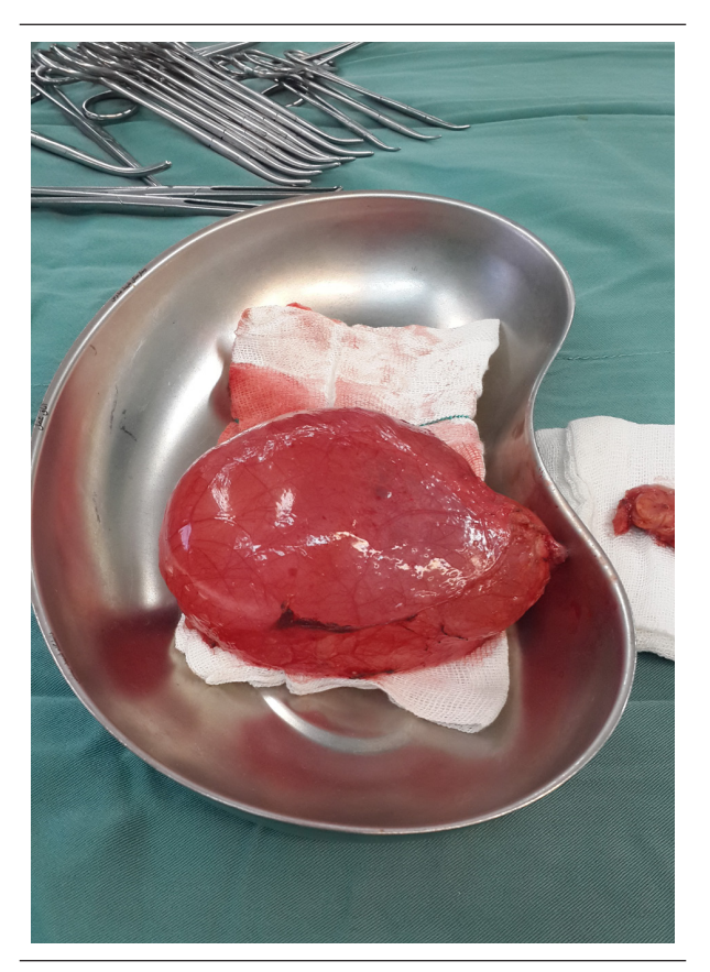
Figure 4. A completely excised huge pericardial cyst placed on the surgical sponge. Image shows an enucleated serum filled cyst.