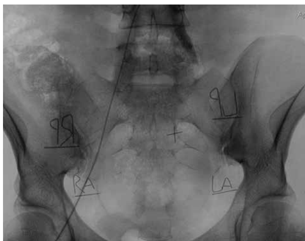
Figure 1. Markers showing TLD location in the pelvic cavity

As mentioned earlier, exposed dose to the ovaries was the main outcome measure of the study. Four dosimeter batches (each containing 3 TLD-100 chips) were used for each patient, two batches on the posterior surface ESD and two batches on the anterior surface of the pelvic region at the level of the right and left ovary. TLD batches were sealed by a waterproof and radiolucent cover and marked by a piece of wire and RA, LA, RP, LP markers (refers to right, left, anterior and posterior) to make their location detectable during the procedure (Figure 1).