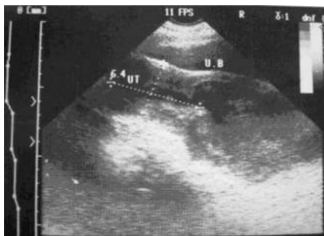
Fig. 1. An 18-year-old patient with primary amenorrhea: Sagittal ultrasonographic view shows hematometocolpos.

Actually, we used to assess all patients with primary amenorrhea with one guideline that preserves complete laboratory and imaging tests, but this algorithm suggests that ultrasonography, as an initial imaging modality, can help us in individualizing further evaluations of patients according to the views it provides from the uterus and ovaries. Total absence or rudimentary uterus in the presence of normal ovaries during pelvic ultrasonography examination, suggests the diagnosis of Rokitansky syndrome 9 , and there is no need for routine chromosomal or hormonal studies. This is true for those with abnormal development of the uterus and müllerian abnormality who