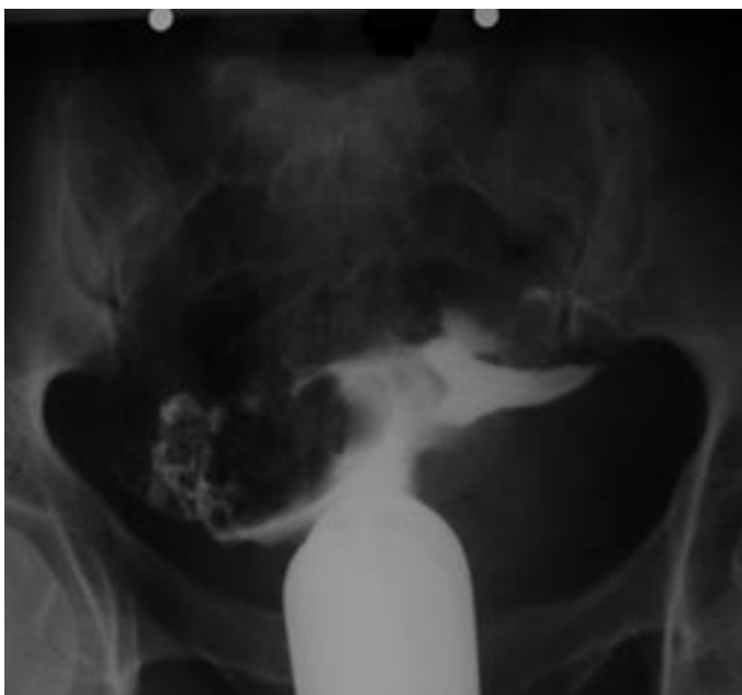
Fig. 1. HSG was reported normal.

We decided to explain one of our cases to show 3D vaginal ultrasound priority over conventional HSG in diagnosing mullerian anomalies. She is a 32-year-old woman with a past history of infertility from 12 years ago. The HSG report was normal (Fig. 1). We performed a vaginal ultrasound study which was suspicious for an arcuate or septated uterus (Fig. 2. A & B), then 3D revealed convex external uterine contour associated with fundal endometrial indentation (Fig. 3). The depth of fundal endometrial indentation was about 8 mm indicative of a subseptated uterus. The distance between the two internal tubal ostia was about 36 mm. The ratio of the depth of fundal endometrial concavity to the interostial line was about 22% which is significant (in cases with a less than 10% ratio, an adverse reproductive outcome is not expected). 6 Findings indicate the usefulness of operative hysteroscopy in this case.