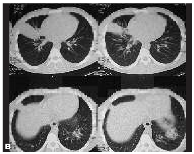
Fig. 2. A 22-year-old male patient with fire eater's pneumonia. (A. A relatively homogeneous density was determined without eliminating the heart and diaphragm contours in his chest radiography. B. Consolidation areas covering the lateral segment of the right middle lobe together with small nodules in the medial segment of the middle lobe and lateral basal segments of the lower lobe. Bronchopneumonic consolidation areas in the left lower lobe are detected in thoracic CT.)

consolidation area completely covering the lateral segment of the right middle lobe was seen together with small nodules in the medial segment of the middle lobe and lateral basal segments of the lower lobe. In addition, bronchopneumonic consolidation areas in the left lower lobe accompanied by peribronchovascular thickenings were seen (Fig. 2B). In the first week, the patient's clinical and laboratory findings improved. Regular chest x-rays were taken and at the end of the first month the chest x-ray had improved completely. The high viscosity products including paraphine had caused a pseudotumoral exogenous lipoid pneumonia. On the other hand, it has been claimed that low viscosity products may cause acute infection.<sup>6</sup> Fire eater's pneumonia generally develops by aspiration of low viscosity hydrocarbons such as kerosene, gasoline and turpentine.<sup>7,8</sup>