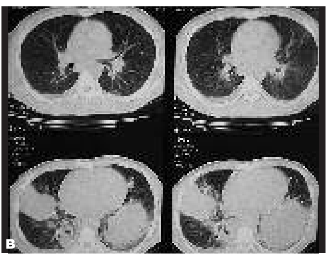
Fig. 1. A 29-year-old male patient with fire eater's pneumonia.( A. Partial opacities eliminate the heart and diaphragmatic contours in the bilateral lower zones in his chest radiography. B. Minimal pleural liquid is seen on the right side with dense and solid parenchymal masses in the bilateral lower lobes, density increases in the form of ground glass together with pulmonary nodules in thoracic CT.)