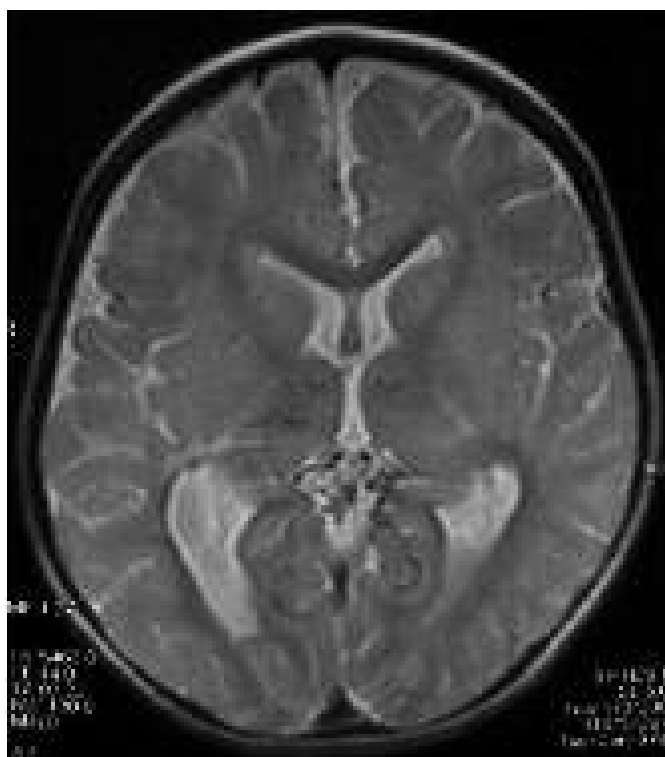
Fig. 2. Axial proton density spin echo MRI shows abnormal tiny tubular structures with signal void suspected as small collaterals in the supracerebellar and retropulvinar cisterns associated with similar findings in both thalami.

Our reported case is an 18-month-old girl that came into observation due to psychomotor delay. She had no focal neurologic deficits or seizure disorders. Delay is said to exist when a child does not reach developmental