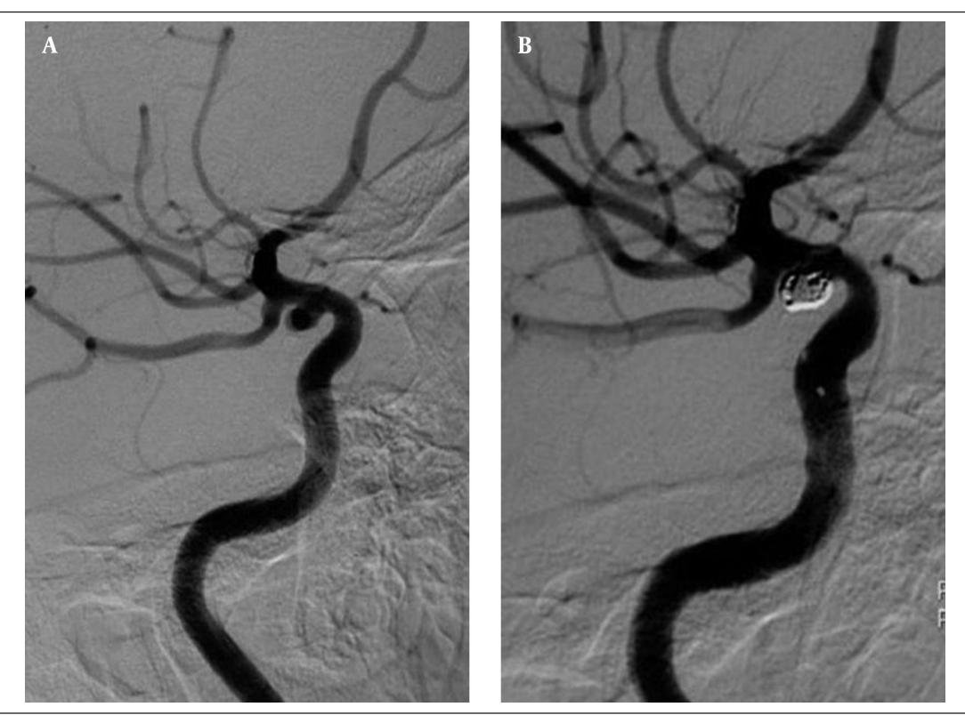
Figure 2. Subtotal coil embolization in a 47-year-old man with right internal carotid artery aneurysm. A, Before coil embolization. B, After coil embolization