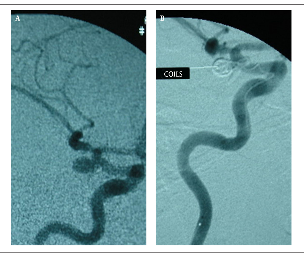
Figure 1. Total coil embolization in a 49-year-old man with right internal carotid artery aneurysm. A, Before coil embolization. B, After coil embolization

Although aneurysms that remained unchanged after six months follow-up angiography had total occlusion after the procedure, this was 50% for those aneurysms that had any changes in 6 months follow up angiography (P value = 0.01).