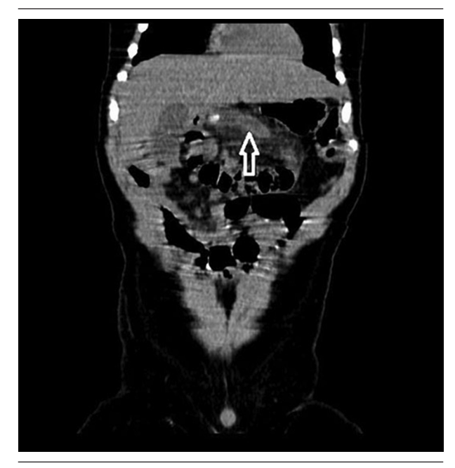
Figure 4. Coronal multi-planar reconstruction (MPR) CT slide demonstrates a tubular structure of 16 mm in diameter (white arrow), posterior to the left lobe of the liver, surrounded by inflamed mesenteric fat.