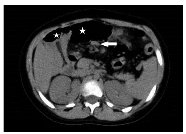
Figure 3. Axial CT slide demonstrates the caecum (stars) and terminal ileum (white arrow) located in the in the epigastric area.