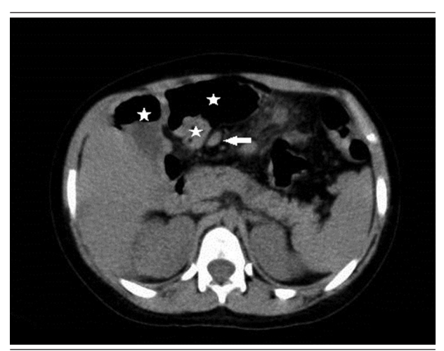
Figure 2. Axial CT slide demonstrates the caecum (stars) and terminal ileum (white arrow) located in the in the epigastric area adjacent to the left lobe of the liver and gallbladder.