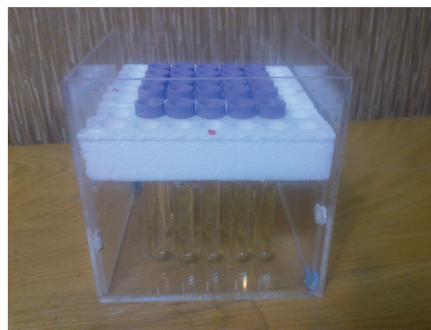
Figure 1. Different concentrations of iron oxide nanoparticles placed inside the phantom

A perspex phantom was designed with dimensions of 13 \times 13 \times 13 cm for the placement of glass vials (internal diameter = 15 mm) filled with various concentrations of iron oxide nanoparticles (Figure 1). The vials were set vertically, and the axes of the vials were perpendicular to the image plane (coronal image). The phantom consisted of 25 vials with different concentrations of nanoparticles that were carefully placed in the center of the standard clinical head coil. The vials in the phantom with a constant concentration were placed in exactly the same positions of the vials with different concentrations for the measurement of coil non-uniformity without removing the phantom from the coil.