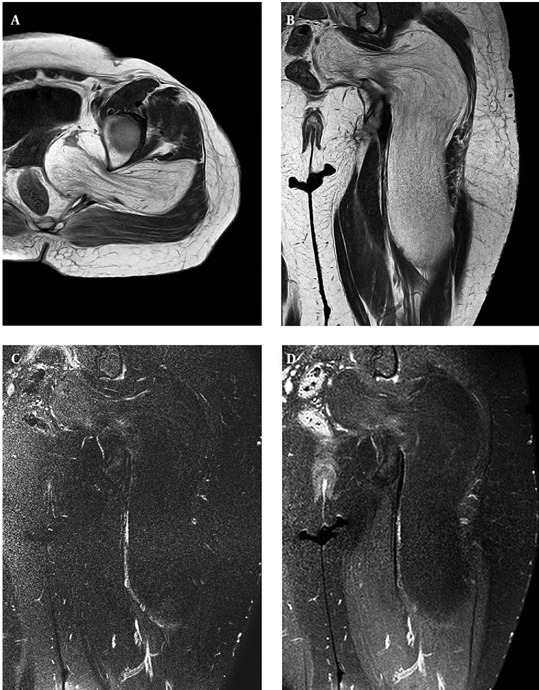
Figure 1. A 60-year-old female patient with a palpable posterior thigh mass and buttock pain. T1-weighted axial (A) and coronal (B) images show a giant space-occupying lesion that is located in the sciatic nerve course. The tumor is isointense to the subcutaneous fat and there is fine fibrillar appearance inside of it. No signal increase on fat-suppressed T2-weighted image is seen (C). Postcontrast fat-suppressed T1-weighted image (D) shows no intensive enhancement except for faint signal increase at the fibrillar appearance that may represent inherent neural fiber enhancement.

mapping, the lesion demonstrated a low signal, isointense to subcutaneous fat, due to a fat-saturated pulse that was