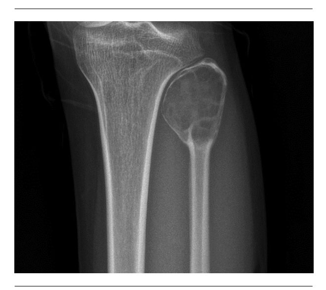
Figure 1. A 22-year-old woman with exercise-related leg pain and no previous history of trauma. Plain radiography of the left knee joint shows a well-defined lytic lesion extending from the metaphysis to the epiphysis of the left fibula. Balloon-like expansion and cortical thinning with endosteal scalloping is also seen.

loping was seen. In addition, there was no internal sclerosis or cortical disruption.