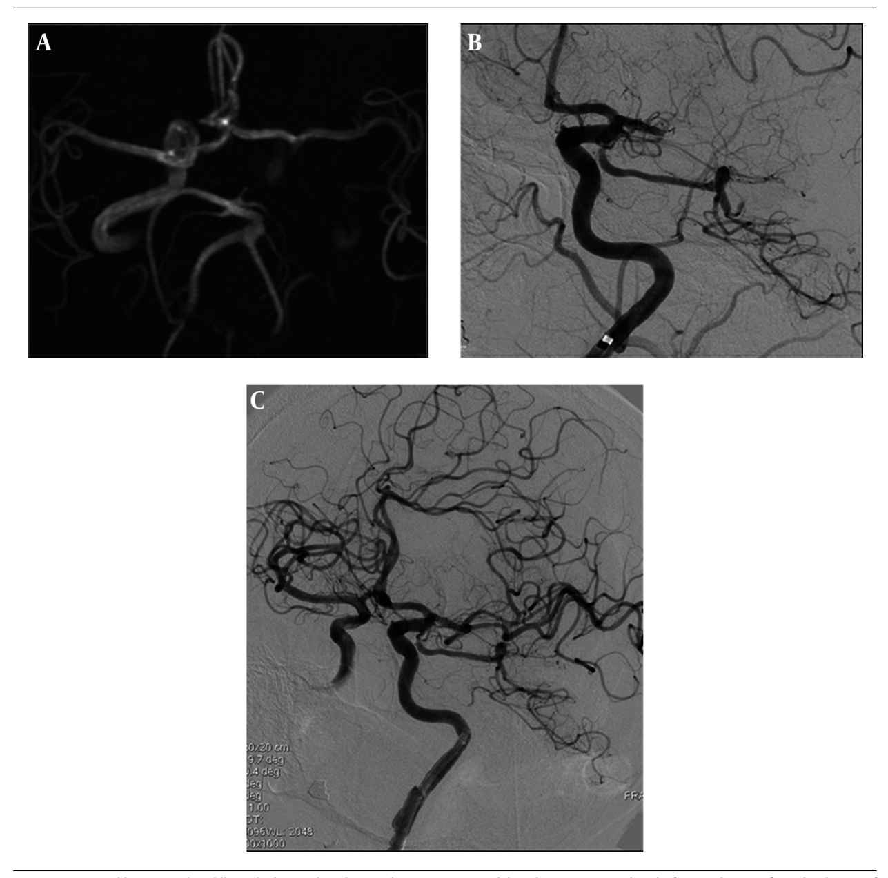
Figure 1. A 66-year-old woman with middle cerebral artery thrombosis underwent stent-assisted thrombectomy. A, Cranial axial reformatted MRA performed at the time of admission showed a thrombus occluding the left ICA extending to the supraclinoid segment. Left MCA flow was from the anterior communicating artery; B, Cranial digital subtraction angiography demonstrated the guiding catheter at the distal part of the left ICA cervical segment and the occlusion of the left MCA; C, Cranial digital subtraction angiography showed a focal, nonprogressive ICA dissection at the distal cervical segment and recanalization of the MCA. Note the patient's left ICA segment.

For anterior circulation strokes, while withdrawing the thrombus with the aid of the thrombectomy stent, there is a risk of dislodgment of the thrombus to distal branches of the MCA and anterior cerebral artery (ACA). In order to decrease the risk of dislodgment, it is preferred to use a balloon guiding catheter to stop the flow and perform suction during withdrawal of the thrombus.