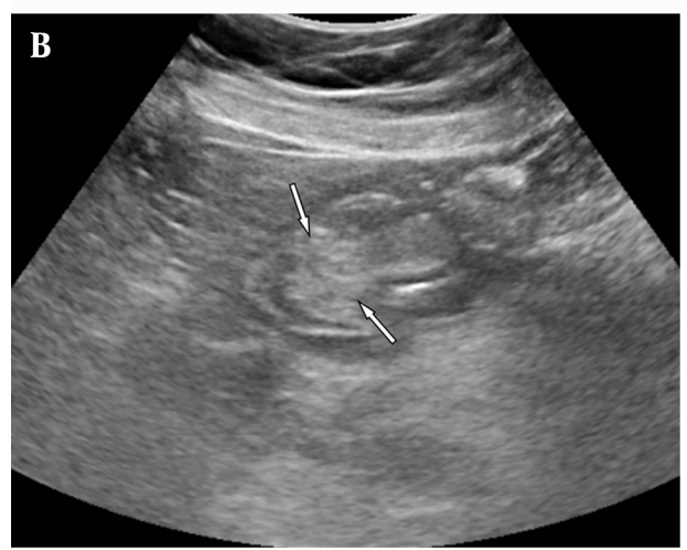
Figure 1. A 54-year-old woman with melena and severe anemia. A, Transverse gray-scale sonography of the epigastrium in the supine position shows a hyperechoic polypoid mass (arrows) in the gastric antrum lumen (asterisks), which is covered by thickened hypoechoic mucosa (open arrows) except for the right lateral side (arrowhead), suggesting denuded mucosa; B, On transverse gray-scale sonography of the epigastrium in the right lateral decubitus position, the mass (arrows) prolapsed toward the duodenum, indicating a pedunculated morphology.

to the risk of recurrent bleeding. The resulting gross specimen included an intraluminal polypoid mass measuring approximately 4 \times 2 cm in size, with focal denudation of the mucosal surface of the tip. The cut surface of the mass revealed lobulated contours with a whitish-yellow solid area, as well as focally denuded mucosa (Figure 3A). Microscopically, most of the mass was located in the submucosal layer and was composed of mature adipose tissue with irregularly-shaped blood vessels and loose connective tissue (Figure 3B). These findings are consistent with FVP. The patient was discharged after an uneventful postoperative course.