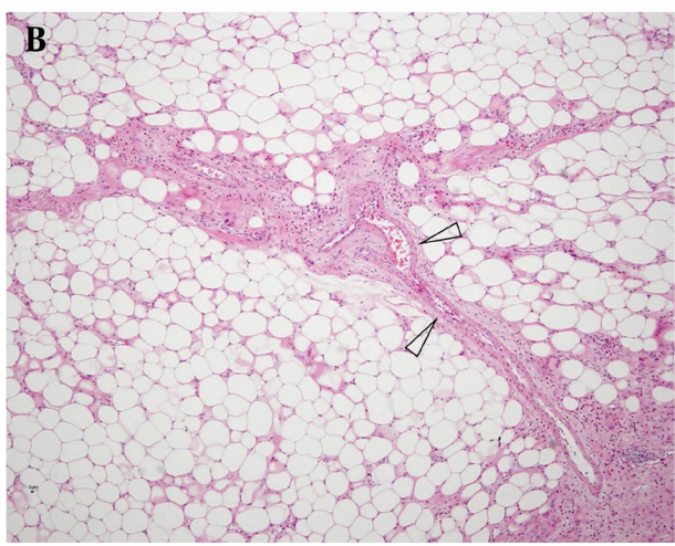
Figure 3. A, The cut surface of the gross specimen of the mass reveals a lobulating contoured polypoid mass with a whitish-yellow solid area. Some portion of the overlying mucosa is denudated (arrowheads); B, On photomicrograph (H & E staining, original magnification, \times 100 ), the mass was composed of mature adipose tissue with irregularly-shaped blood vessels (open arrowheads) and loose connective tissue.

with central heterogeneous low density, suggesting only a minor component of fat tissue and marginal enhancement. In comparison with the previous report, the FVP of the present case contained more fat and was more pedunculated, similar to the predominant imaging features of esophageal FVPs.