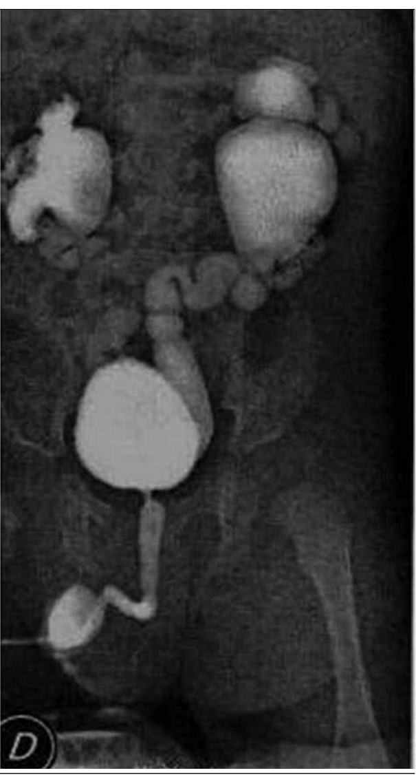
Figure 5. Bilateral VUR with urine cystoureterography (2 months of age)

the bacteria identified in the cultures were gram negative that are rarely responsible for neonatal osteoarthritis, which is usually caused by gram positive bacteria. Involvement of the joints appeared secondary to an early gram negative urinary tract infection (the most common