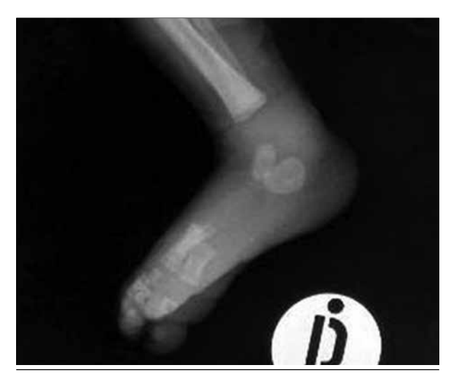
Figure 3. X-ray of the right ankle on admission at 11 days of age

In the follow-up, a voiding cystourethrography revealed a passive vesico-ureteral reflux (VUR) grade 4 on the right side and grade 5 on the left side (Figure 5).