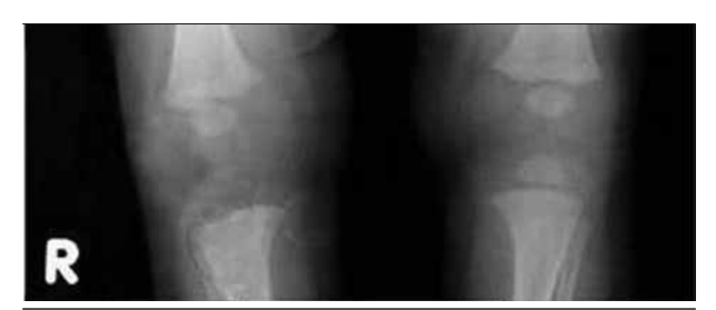
Figure 2. X-ray of the lower limbs 15 days after admission (1 month of age) shows osteolysis of the upper metaphysis of the right tibia.

in the sediment. While urine, blood and synovial liquid cultures were performed, preparations were made for a renovesicle ultrasonography. It revealed a grade 3 bilateral hydronephrosis (SFU) with dilated and twisted ureters (Figure 1 B). Fifteen days after admission, radiography of the right limb showed a zone of osteolysis at the level of the upper tibial metaphysis (Figure 2) and a normal ankle (Figure 3). An empirical intravenous therapy was started with a double antibiotic (ampicillin-sulbactam and gentamicine) and on the following days the blood, urine and synovial liquid cultures were found positive for Escherichia coli with the same antibiotic sensitivity. According to the antibiogram, the empirical therapy was changed to targeted antibiotics and protracted for an overall period of 32 days. Clinically, there was a gradual improvement in the overall clinical picture and the functional recovery of the femorotibial articulation (Figure 4).