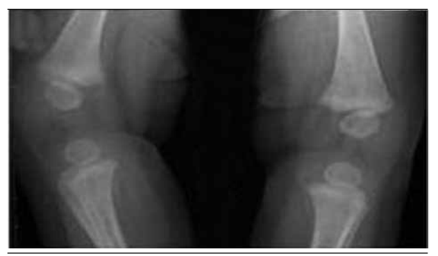
Figure 4. X-ray control at 4 months of age: resolution area of osteolysis

To date, only two cases of osteoarthritis and neonatal urinary infection in patients with VUR have been reported in international literature (1, 2). In the present case,