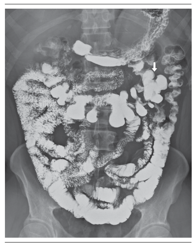
Figure 2. Small bowel GI series using X-ray contrast media. The cecum (arrow) and proximal ascending colon are located in the LUQ of the abdomen, and most of the small intestine is distributed in the right lateral abdomen.

Two weeks postoperatively, a small-bowel GI series using X-ray contrast media was performed because of the abnormal position of the cecum. The cecum and proximal ascending colon were located in the LUQ of the abdomen and most of the small intestine was distributed in the right lateral abdomen (Figure 2). Intestinal malrotation was diagnosed.