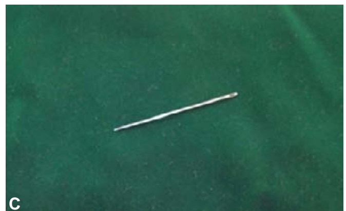
Fig. 1. An 18-year-old man with an ingested foreign body.

A. Plain abdominal x-ray shows a needle-like object (arrow) in the RUQ.