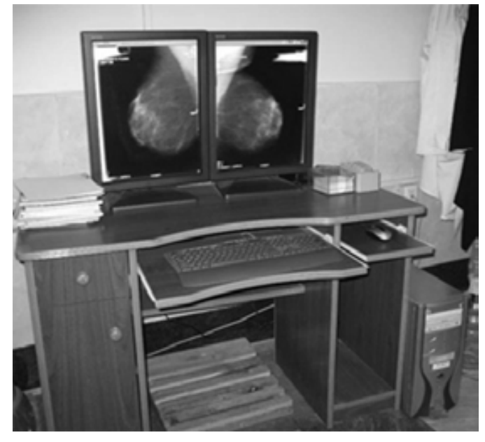
Fig. 1. The workstation and two 21", 3 M-pixel mammography medical monitors used in this study.

initial mammography. Participants were considered negative for cancer if they were not considered positive and if they were found negative on follow-up mammography and/or subsequent workups.