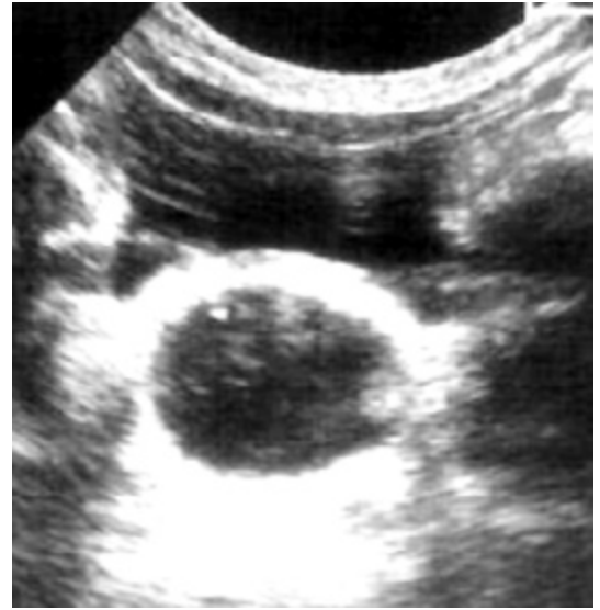
Fig 3. Small sessile polyp in left lateral wall of rectum

Thus, polyps in this segment may be overlooked. 4