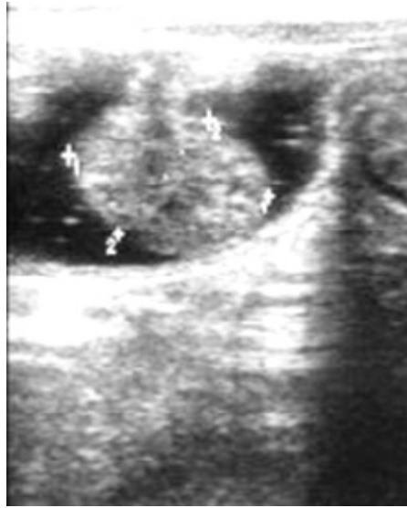
Fig 2. Pedunculated polyp in hydrocolonic sonography