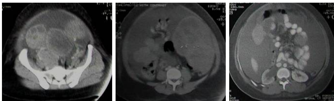
Fig. 1. Spiral abdominopelvic CT with oral and intravenous contrast reveals ascites, bilateral pelvic masses, intraperitoneal masses, encasement of the right ureter by tumor and right-sided hydronephrosis.

Burkitt's lymphoma occurs most commonly in