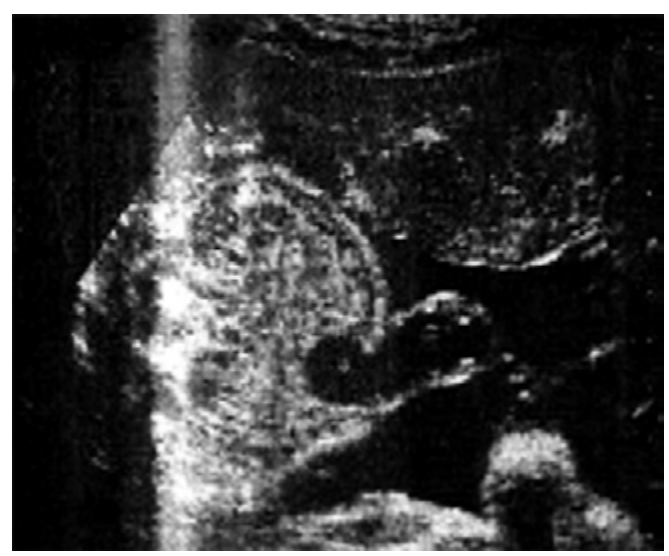
Fig 3. Varix (asterisk) of the umbilical vein.