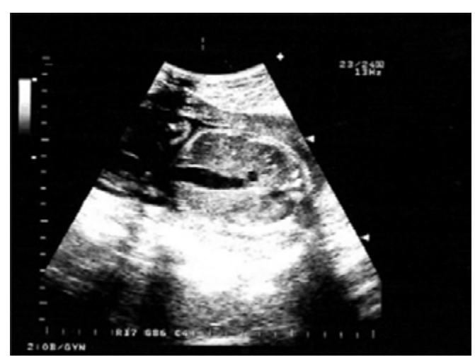
Fig 1. Transabdominal ultrasound shows the increased diameter of the affected umbilical vein.