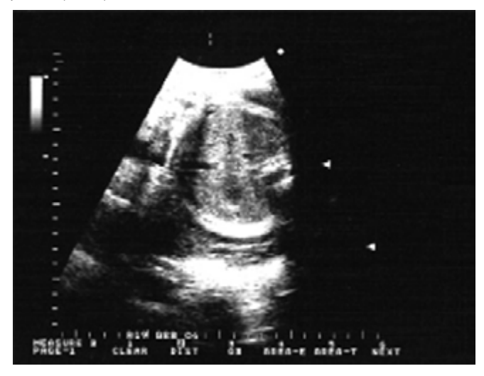
Fig 5. Transverse view of the fetal abdomen at 22 weeks' gestation.