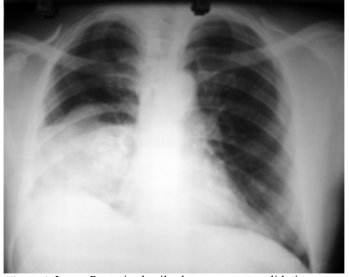
Figure 1: Large Posterior basilar lung mass consolidation

enhancement after administration of contrast medium on MR imaging. Finally, the patient had a surgery. A large tumor at the inferior portion of the right hemithorax arising from the posterior portion of the 8th rib was seen. Tumor was situated over the diaphragm; however, it could be isolated easily from underlying diaphragm and the lung without resistance. Destruction of three ribs and some minimal destruction of the 8th thoracic vertebral body were noted. Tumor passing through the neural foramen had produced a dumb-bell shaped mass. Posterolateral thoracotomy was performed along with resection of the chest wall with removal of three ribs (7th, 8th, and 9th) and half of the 8th vertebral body was carried out. The tumor had apparently invaded the spinal canal and epidural space.