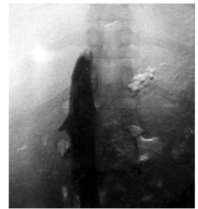
Figure 1: The venographic picture of complete obstruction of the IVC.

During the thrombolytic therapy, the serum fibrinogen level was measured every 12 hrs, which ranged between 160 and 200 mg/dl. After completion of thrombolytic therapy (on the third day), Doppler ultrasonography showed an acceptable patency of both IVC and hepatic vein due to complete resolution of the thrombi (Figure 3). Thereafter, the standard anticoagulant therapy was started; the patient was heparinized first. It was followed by administration of warfarin for attaining a target international normalization ratio (INR) of 2 to 3. To maintain a hemoglobin level <12 gm/d1, 1,000 mg/d hydroxyurea along with repeated aggressive phlebotomy was begun since the first day on. The patient's weight and abdominal distension gradually reduced until the 15<sup>th</sup> day of admission.