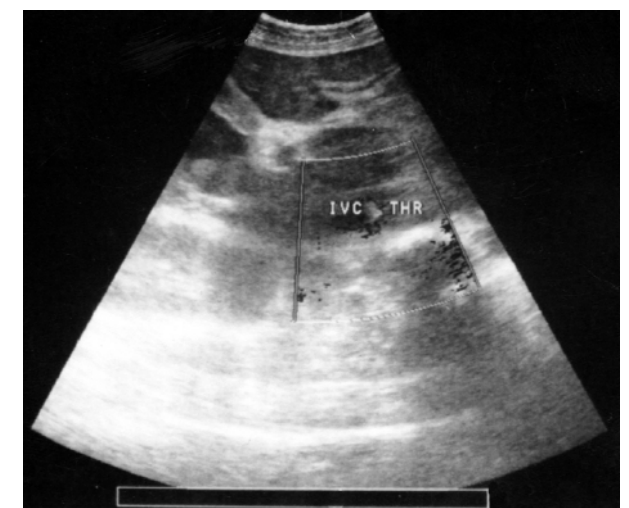
Figure 2: The location of venous thrombosis in the IVC as appears on the ultrasound.