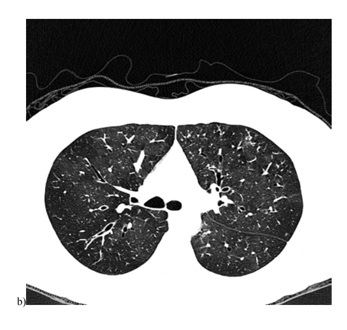
Figure 1. Typical HRCT finding of chronic mustard gas injury to the lung:

a) Presence of bilateral air trapping with alteration of normal antero-posterior lobar attenuation gradients. Expiratory image is essential for demonstration of air trapping