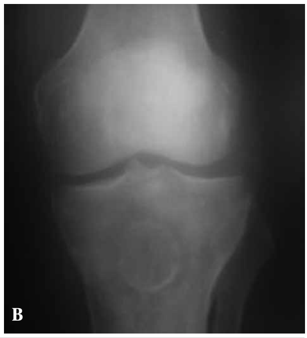
Figure 1. A-69-year-old male with left knee pain and a well corticated ossified intramedullary lesion in the proximal tibial metaphysis; A, Lateral view; B, Antero-posterior view