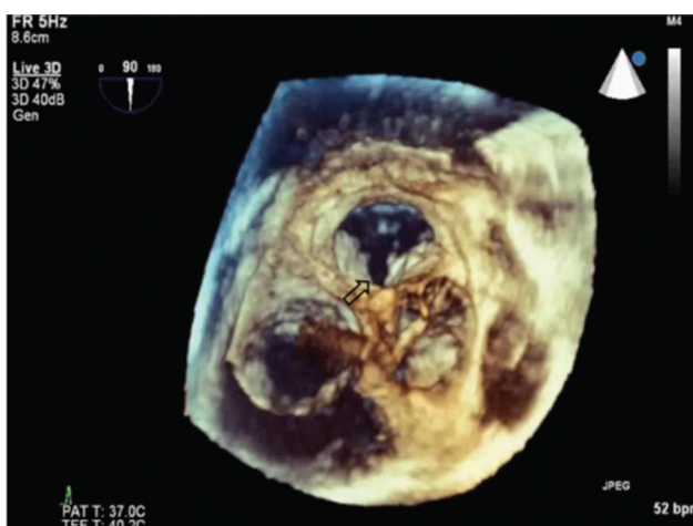
Figure 2. Cleft of the Anterior Mitral Valve Leaflet Seen on Three-dimensional Echocardiographic View (Arrow). The Cleft Is Seen from the Left Atrium. The Anterior Leaflet Is Bisected into Two Equal Parts.

the cleft involves the anterior leaflet of the mitral valve (1). It is seen as a part of an association involving defects in the Atrioventricular (AV) septum with the absence of a common AV junction, called left-sided AV valve cleft and mostly diagnosed in childhood. Less commonly, mitral clefts are encountered as an isolated abnormality of an otherwise morphologically normal mitral valve, referred to as the so-called isolated cleft mitral valve. Clefts in the posterior leaflet are rarely reported.