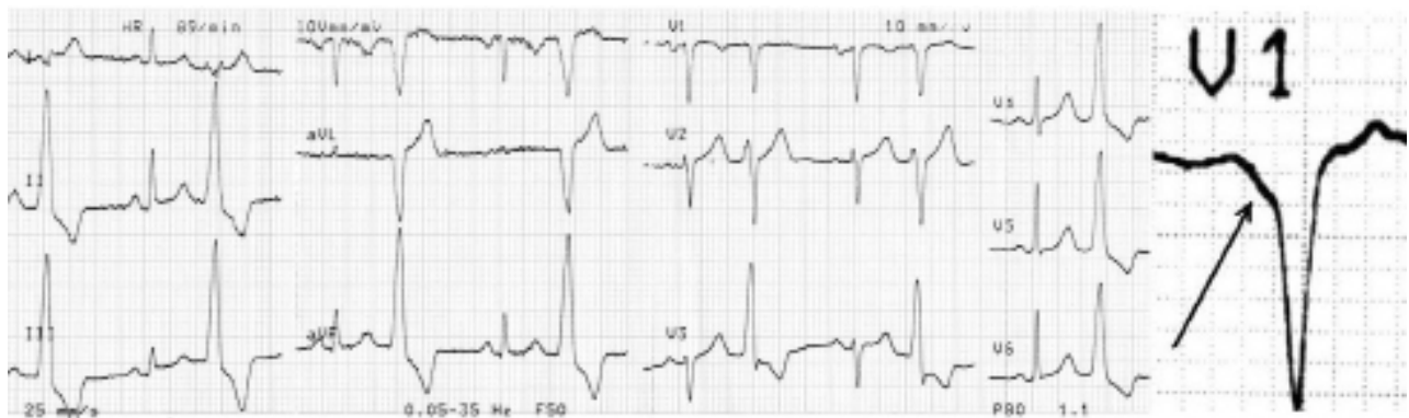
Figure 3. Views of Ablation Catheter

localizing the site of origin of arrhythmia in our patient. This allowed efficient and rapid identification of the arrhythmia focus and ablation of the PVCs.