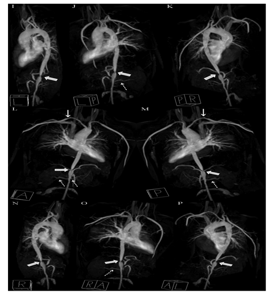
Figure 3. Magnetic resonance angiography of aorta; Suprarenal stenosis of abdominal aorta is located above the celiac axis (thick arrow). Right aberrant subclavian artery is shown with arrow. Renal arteries are shown with dashed arrow. Each view is shown in the box on the bottom of each figure; A, anterior; L, left; P, posterior; R, right.

It is believed that claudication is a less common symptom in cases of suprarenal hypoplasia.<sup>7</sup> However, one of the major symptoms of our patient was lower limb claudication despite her lesion site which was suprarenal. Considering the presence of these two unusual symptoms in our patient it can be concluded that predicting the presenting symptoms based on the location of the coarctation site alone may seem illogical. Because in the presence