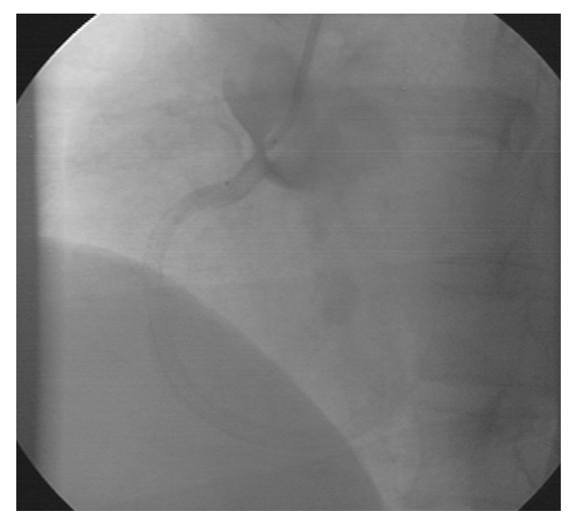
Figure 2. Beginning of retrograde extension of coronary dissection into the Aorta

Catheter-induced coronary dissection is rare but potentially life threatening complication. Although the reported incidence of coronary dissection involving the aortic root was 0.02% for diagnostic angiography (6), it was 0.07 for coronary angioplasty cases.<sup>13</sup> The mechanism by which dissection of the right coronary artery occurs more frequently than the left is not clear.<sup>1,3,4,14</sup> In histological and structural