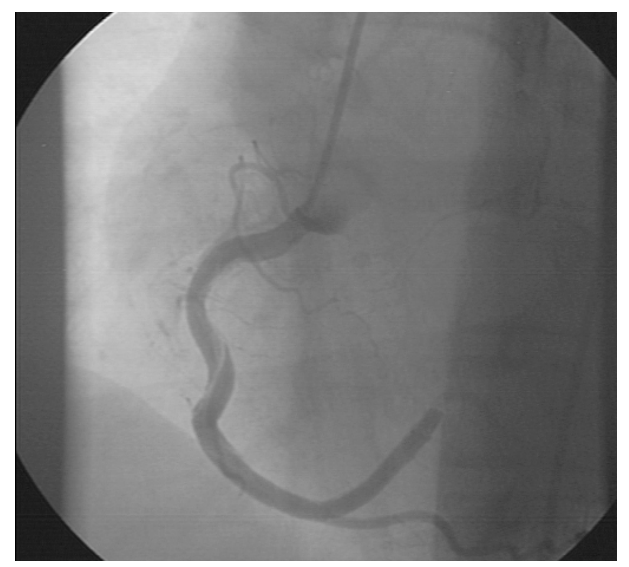
Figure 1. Spiral dissection of the Right Coronary Artery from Ostium to distal portion

extending about 2 mm into the right coronary sinus was placed to seal the entrance point of aortic dissection. During the procedure we noticed that the line of aortic dissection was propagated retrogradely involving the ascending aorta (Fig. 2, 3). At this point we performed TEE in the cath lab to monitor the size and extension of aortic dissection (Fig. 4). The dissection of aorta was limited to about 35mm of the proximal part of ascending aorta, and the false lumen had no flow evaluated by color flow Doppler. We therefore decided to manage the patient medically. The patient was transferred to intensive care unit. Her rhythm was converted to sinus rhythm after about 4 hours. Her hemodynamic condition became stable and repeat transthoracic echocardiography showed mild left ventricular dysfunction (ejection fraction about 45%) without any evidence of pericardial effusion or extension of the dissection. TEE was performed after 24 hours and found no further abnormality. The patient's general condition improved significantly, but CPK-MB isoenzyme increased to 6 times the normal level. The patient was discharged from hospital after about 6 days and following about 3 months she is doing well