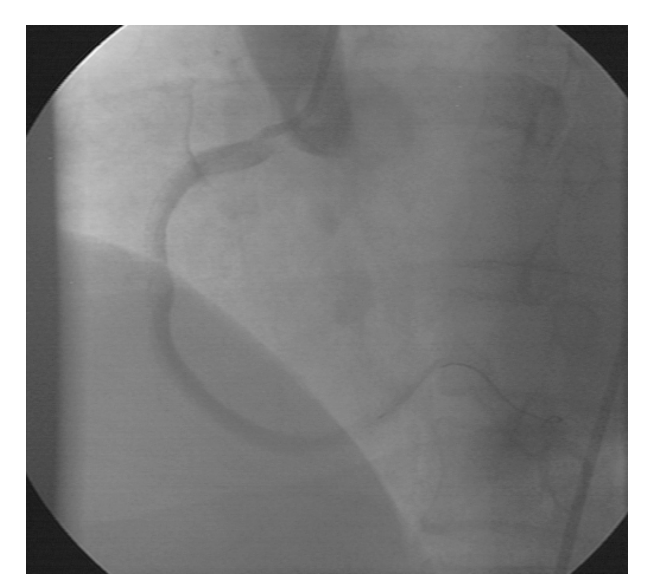
Figure 3. Extension of the Aortic dissection

TEE was up to 35 mm and after stenting of the entry point of the dissection which was illustrated by TEE, did not progress. We therefore believe that in regard to such fateful events the availability of TEE in the cath lab can be very helpful for making a decision.