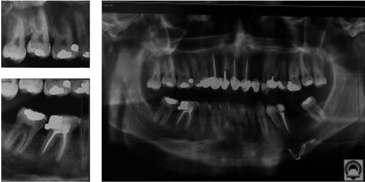
Figure 2. Panoramic and Periapical Views