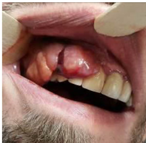
Figure 1. An Exophytic Mass in the Right Side of the Maxilla

Oral mucosal melanoma is a rare malignancy (13). Despite its rarity, melanoma is the most important pigmented lesion of the oral cavity due to its poor prognosis and a high mortality rate. Thus, every single and stable pigmented lesion in the oral cavity must undergo biopsy