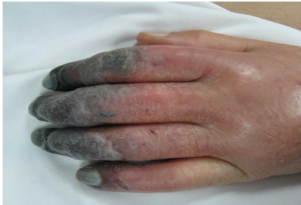
Fig. 3. Cyanosis in fingers in four extremities developed to complete gangrene.

nasal passage, nasal cavity and nasopharynx (Figure 3) the left nasal passage was chosen for nasal intubation. The left nasal cavity was first anesthetized; but there was difficulty for administration of lidocaine spray since the patient was under treatment with a maintenance dose of anticoagulant. A combination of lidocaine plus phenylephrine on cotton swab was administered in the anterior nares area, the anterior ethmoidal nerves; and sphenopalatine ganglion. A number 7 cuffed tracheal tube was passed through the nasal cavity to the trachea over the fiberoptic bronchoscope; its passage was preceded by direct visualization and approval of the vocal cords and then, the trachea; due to patient dyspnea, bronchoscopy was done in sitting position (Figure 4). The vocal cords had changed from their normal status to severely enlarged and edematous