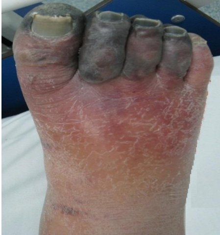
Fig. 2. Right lower extremity cyanosis was noted which spread to four extremities 24 hours after first cyanotic changes.