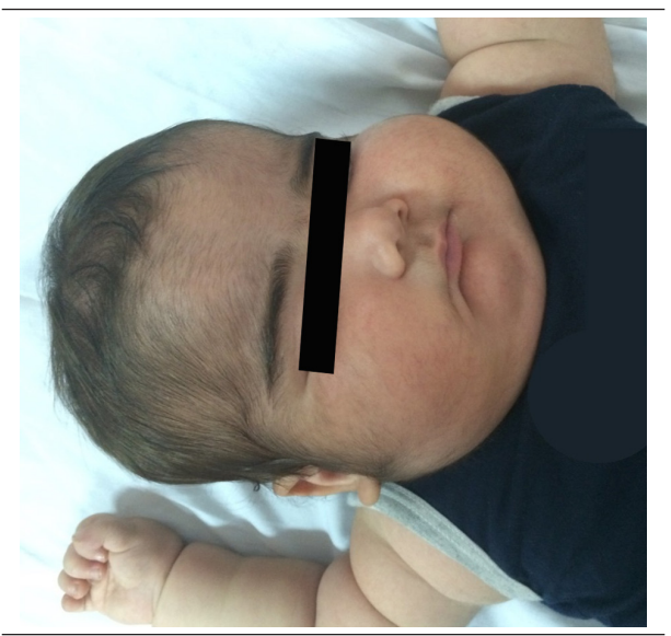
Figure 1. An 11-Month-Old Boy (Case 1) Presenting With a Moon Face Appearance and Telangiectasia on the Cheeks

The patient was a 4-month-old boy referred due to a cushingoid face (Figure 3). He was born full term from unrelated, healthy parents by cesarean delivery. On physical examination, his weight and height were normal, at 6.650 kg (between 25th and 50th percentile) and 63 cm (on 50th percentile), although cushingoid features were noticed. The mother had applied clobetasol cream on the diaper area since birth until 3 months and 1 week. Despite clinical manifestations of Cushing's syndrome, serum cortisol and ACTH were low (Table 1). Sonography of adrenal glands was normal. Arterial blood gas, cell blood count, 3-hour fasting plasma glucose, and the biochemical profile were all normal. The orders for stress were suggested for him and hydrocortisone was not administered.