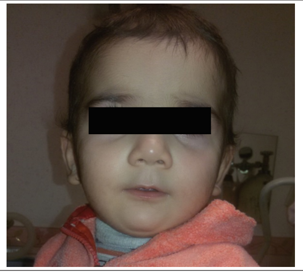
Figure 2. 4 Months After Hydrocortisone was Stopped (Case 1)