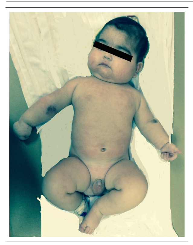
Figure 3. A 4-Month-Old Boy Referred Due to Cushingoid Face