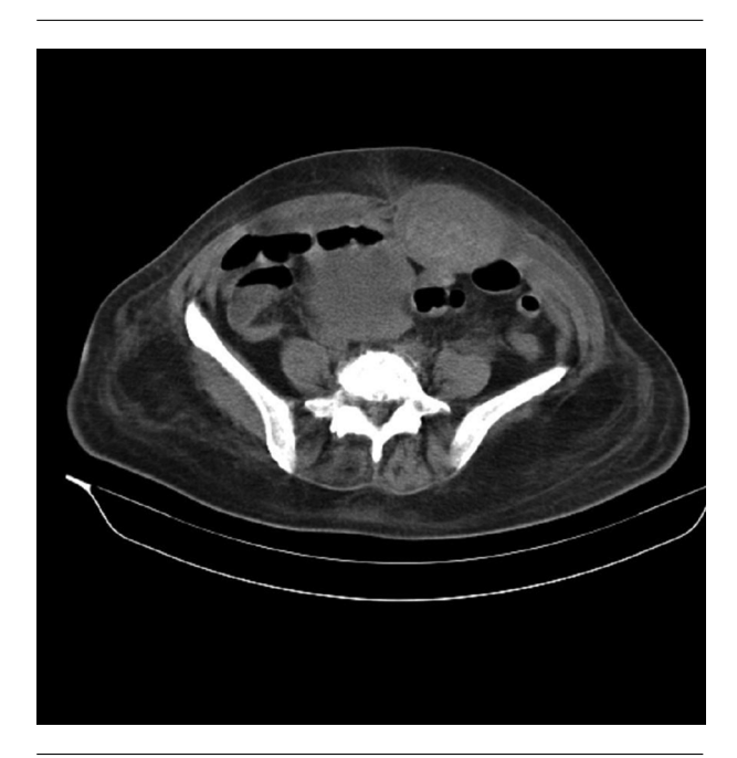
Figure 1. Abdominal Computerized Tomography Scan of Abdominal Mass Like Lesion Due to Hematoma