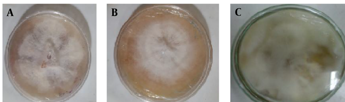
Figure 2. A and B, Samples of successive subcultures of mycelium; C, Sample of the fluffy mycelium for DNA extraction.

a P value between H 2 M and H 2 N ≤ 0.00001, P value between H 2 M and H 2 F ≤ 0.0008, P value between H 2 N and H 2 F ≤ 0.0001, P value between 737M and 737N ≤ 0.00001, P value between 737M and 737F ≤ 0.0047, P value between 737N and 737F ≤ 0.001.