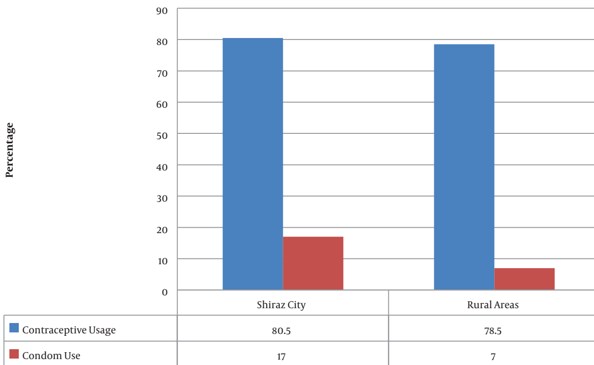
Figure 1. The percentage of condom usage of contraceptive usage in Shiraz county

vealed that condom usage among couples, who had agreed on the use of a certain type of contraception was 48.8%, while the rate among couples, who did not agree on the contraceptive method was only 26.0% ( P < 0.05 ).