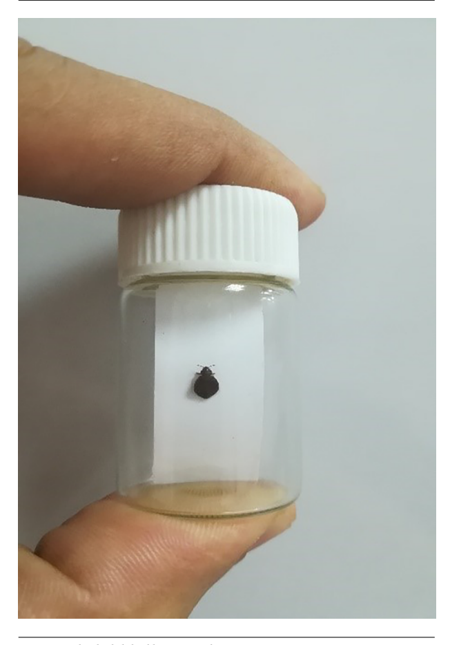
Figure 1. A dead adult bed bug in a vial

A 10-item researcher-made questionnaire was completed by the participants. Five questions assessed the level of knowledge and awareness in participants about bed bug habitat, transmission, medical importance, prevention, and control methods. Also, other questions provided data about the gender, age, level of education, and