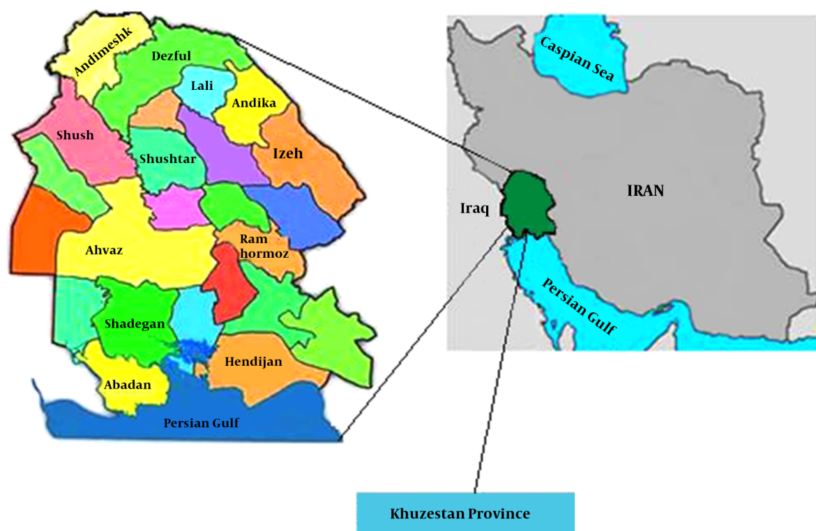
Figure 1. Map of Iran and Khuzestan Province

DNA (100 ng), and 1 \mu L of forward and reverse primers at 25 pmol were applied in a total volume of 25 \mu L. The PCR condition was as follows: predenaturation at 94°C for 4 minutes; denaturation at 94°C for 1 minute, annealing at 52°C for 1 minute and extension at 72°C for 1 minute, followed by 30 cycles; final extension at 72°C for 5 minutes in a thermal cycler (Bio-Rad, Hercules, CA, US). The PCR product was analyzed by electrophoresis on 2% agarose gel in 1X TBE buffer and visualized using ethidium bromide staining on UV transilluminator.