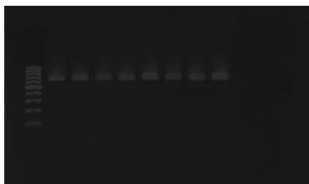
Figure 1. Polymerase Chain Reaction Amplification of the ipaH Gene

M, DNA molecular size marker (100-bp ladder); lanes 1-8, E. coli clinical isolates containing the ipaH gene (619 bp); lane 9, negative control (without DNA template).