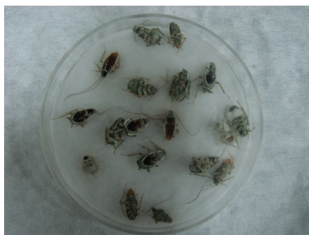
Figure 4. Cockroach Cadavers on Damp Filter Paper With Muscardin Symptoms