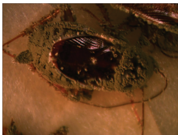
Figure 3. Female Cadaver With Green Muscardin

Although the cuticle of insects constitute an important physical barrier for protection against penetration of entomopathogenic fungal conidia, high mortality rates were observed when adults were exposed to powder formulations. Intersegment regions of the thorax and abdomen, mouthparts and legs (Figures 1-4) as favorable areas for conidia adherence are more difficult to clean and lead to conidia penetration and adult contamination (17).