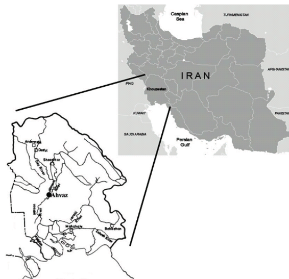
Figure 1. Map of Iran, Showing the Location of Khuzestan Province

yleneblue and examined microscopically and graded as 1+, 2+, 3+ and 4+, according to number of amastigotes in each high power field of microscope (9).