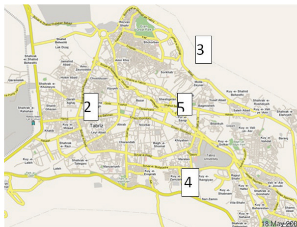
Figure 1. Descriptive Map of Sampling Areas

performed from the air in 262 plates containing Sabouraud's Dextrose Agar (SDA) (Oxiod Ltd., Basingstoke, Hampshire, U.K.) medium during a 12-month period, and from different parts of the city. The triplicate sampling from different locations (northern, southern, western, eastern and also central regions) of the city was carried out on the same days every week during the survey period (Figure 1).