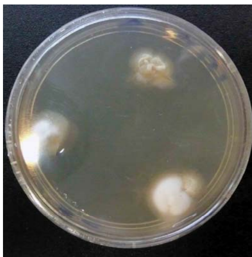
Fig. 3: Culture of T. concentricum on SDA after four weeks incubation, the velvety cream colonies become verrucous to cerebriform with aged