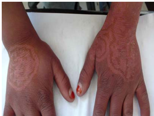
Fig. 1: Polycyclic and scaly cutaneous lesions backside hands and wrist

potassium permanganate for daily washing for four weeks. To date (after 13 months) any complaint has not been reported about infection relapse from the patient.