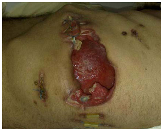
Fig. 3: Open window region in chest of patient

after diagnosis of TB, oral antituberculous treatment with four drugs was started (isoniazide: 300mg/daily, rifampin 600mg/daily, pirazinamide 1.5g/daily, ethambutol 1g/daily) for two months and then continued with two drugs (isoniazide: 300 mg/daily, Rifampin 600mg/daily) for four months. Finally, in order to prevent bone tuberculosis, we continued treatment with two drugs (isoniazide: 300mg/daily, rifampin 600mg/daily) for two more months. The patient was treated completely.