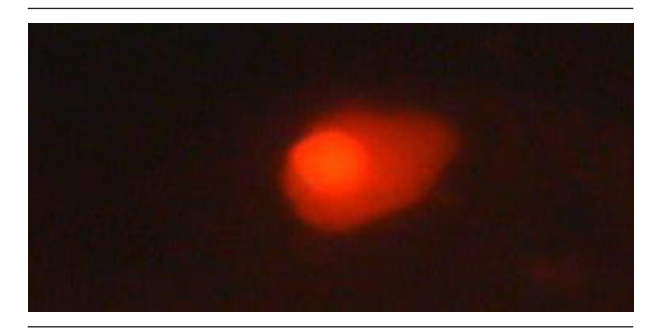
Figure 3. Microscopic Photograph 3 Score 2