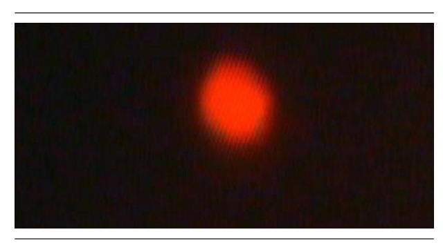
Figure 1. Microscopic Photograph 1 Score 0