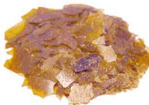
Figure 3. Oven Dried Quince Seeds Mucilage

Phytochemical results are shown in Table 1. The screening of chemicals showed positive test results for carbohydrates, the most important ingredient that should be present in mucilage. However, for the other constituents