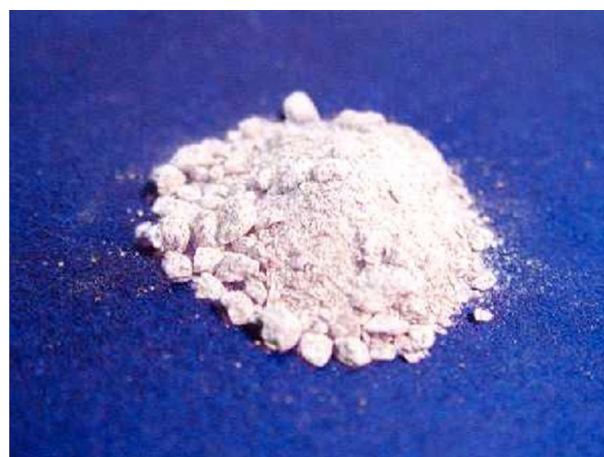
Figure 4. Freeze Dried Quince Seeds Mucilage