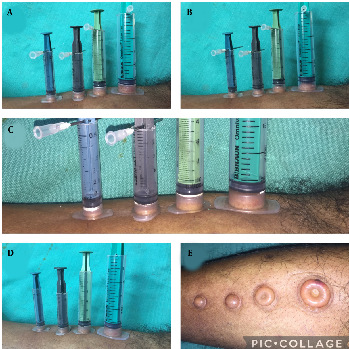
Figure 2. A - E, The syringes of set A at the suction heights of their different radii for suction over the right shin in different phases of suction.

syringes is proportional to an earlier report of suction timing at the suction height of 6.5 cm. In conclusion, the minimum suction height of the syringes should be roughly proportional to their diameter (not to the radius of the suction cup due to piston head projection) to get a complete and intact blister. Thus, a modified disposable syringe set is a faster and an effective suction tool even at the suction height of its radius, if it is applied in an airtight manner on an immovable site. Based on these findings, the disposable