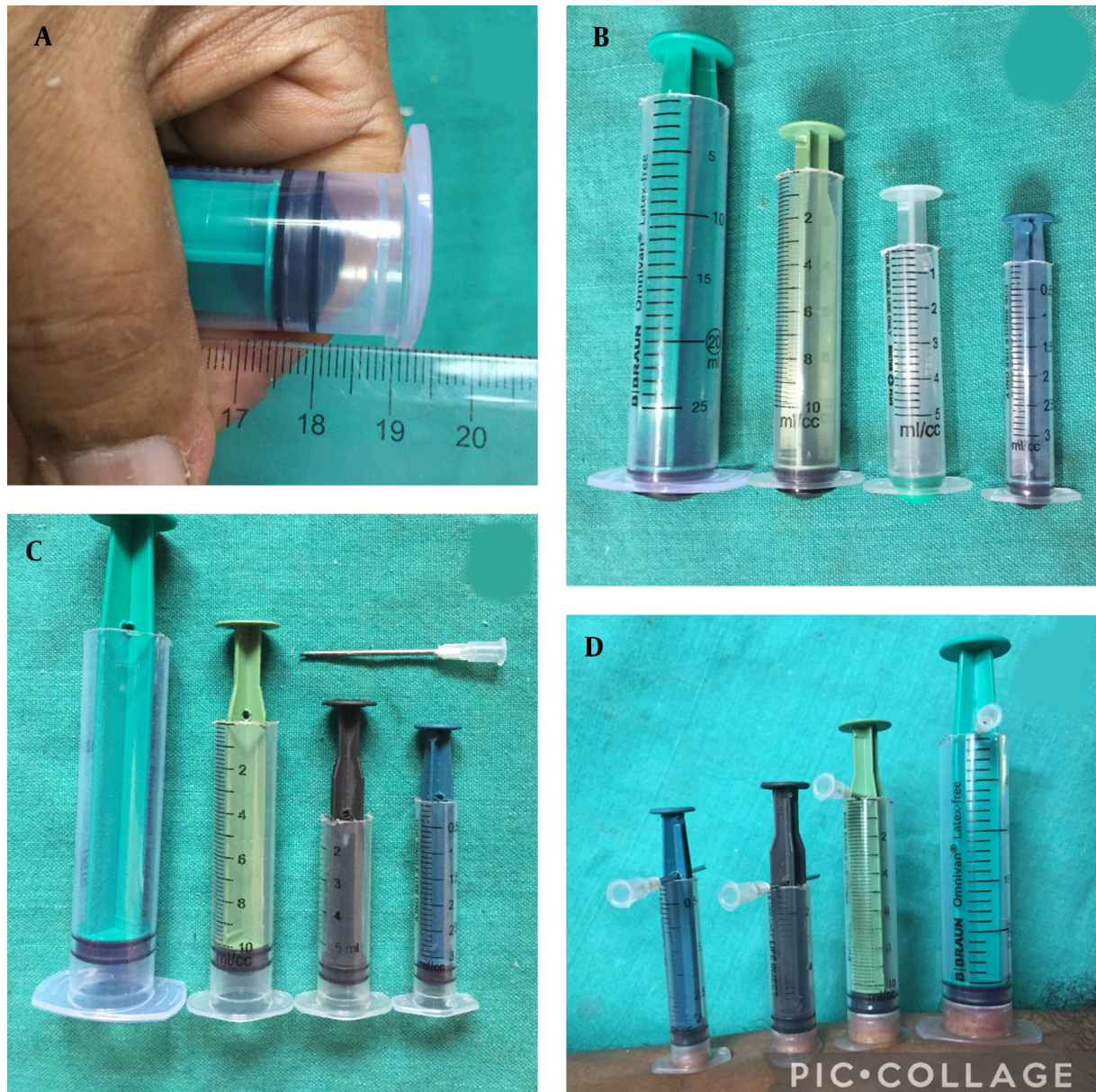
Figure 1. A - D, Different steps are required for making a set of suction syringes.

vice for better and fast suction (Figure 3A-D). The changes over the suction sites were properly noted.